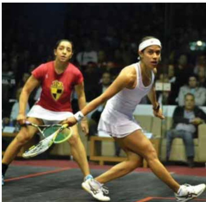
Nicol David, world's top-ranked player for 9 years, competes at China Open in 2015.

When she stepped foot on the court that day in Cairo, David had the weight of the nation on her shoulders. She was expected to win. After all, she was the seven-time world champion. And just a month earlier, she had become the first player in the world to rank