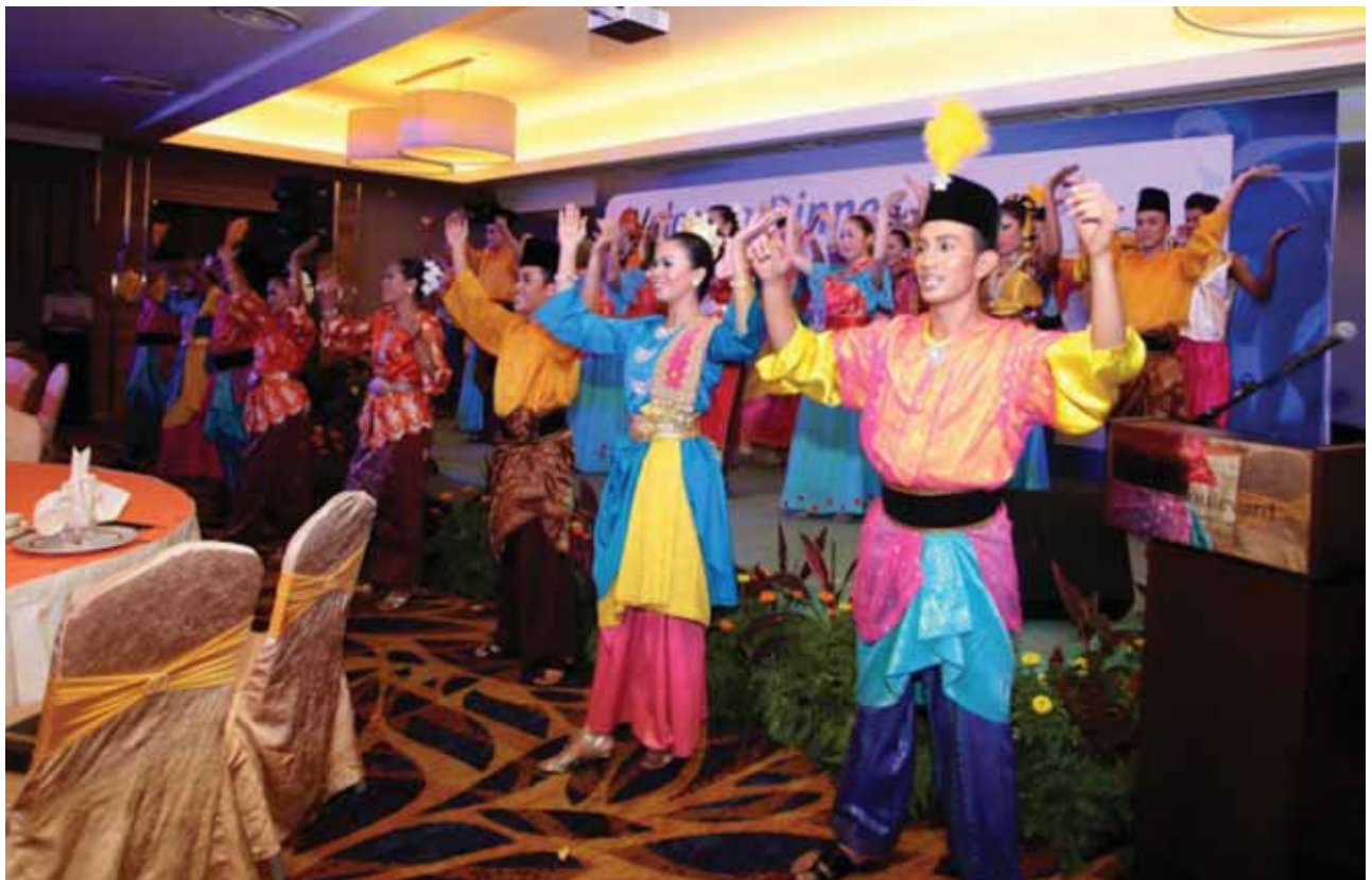
Malay traditional dancers welcome competitors to 2015 Asian Junior Championship.

On May 23, 2009, in addition to squash enthusiasts in other countries, squash centers, clubs, colleges, universities, schools, the Armed Forces Squash Centers, and the Police Squash Clubs from more than 53 venues in 14 states in Malaysia came together to support a bid – “Squash for